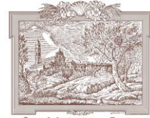
San Michele in Bosco Area Monumentale I.R.C.C.S.

SERVIZIO SANITARIO REGIONALE EMILIA-ROMAGNA Istituti Ortopedici Rizzoli di Bologna